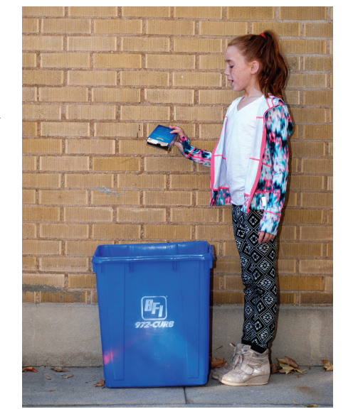
Figure 1. Student reducing energy consumption through recycling.

In 2010, the Polar Bear Challenge was launched to elementary schools in the 13 school districts that surround Hogle Zoo. Teachers began by having their classes calculate their carbon footprint. Then they worked with their students to explore ways their class could reduce their energy consumption. The class was then asked to choose an action – many chose multiple actions – and make those changes at their school or in their homes (Figure 1). To participate in the challenge, the classes needed to carry out their carbon footprint reduction actions for a minimum of 21 days over a two-month period. At the end of the 21 days, the class recalculated their carbon footprint. Teachers then