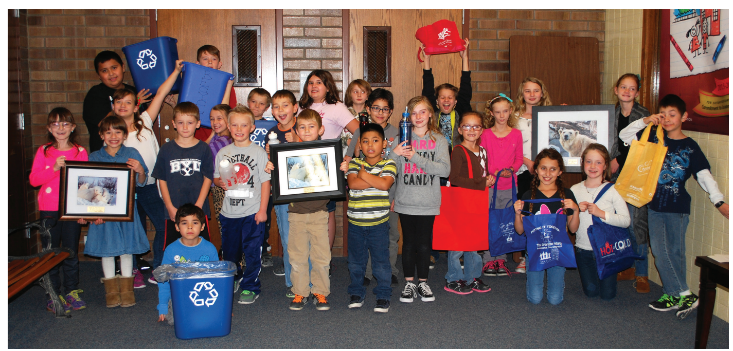
Figure 2. Polar Bear Challenge winners from Harry S. Truman Elementary School, West Valley, Utah.