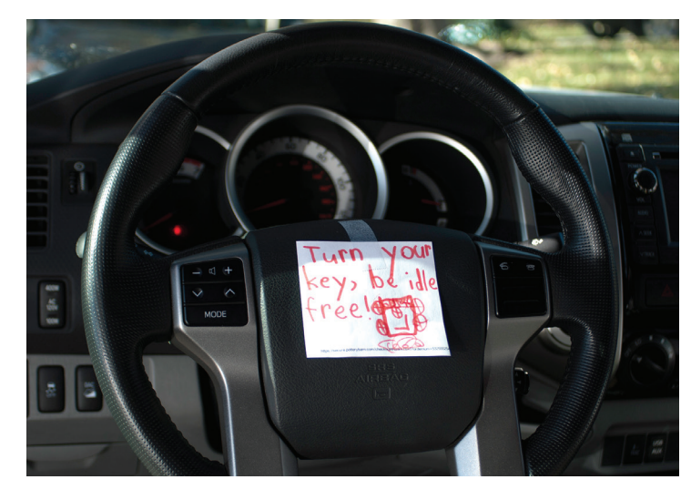
Figure 5. Student note from a No Idling Campaign.

In 2015, another grant through the NOAA Climate Stewards Education Project was approved and an app that will help teachers calculate their carbon footprint data in a more standardized way is in the process of being created. Although the curriculum provides the teachers with reputable online calculators, such as the Environmental Protection Agency's Carbon Footprint Calculator, not all data has been calculated correctly and often takes quite a bit of the Hogle Zoo staff's time to recalculate. When completed, the app should not only provide a standardized method of calculation, but also help