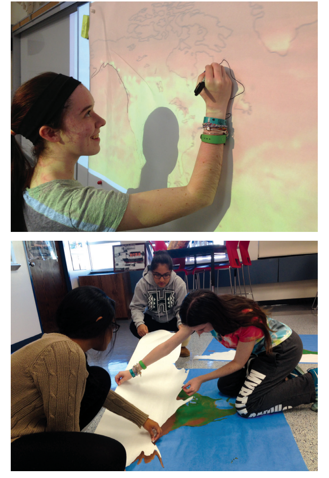
Figure 2. Climate Stewards Club members making Climate Change lesson maps.

nized specific learning opportunities the group experienced that they identified as helpful to their emotional and professional growth. All of the group's participants identified the public presentations to the Superintendent of Schools and the local Board of Education, as well as the informal presentation via a videoconference with a school in Taiwan as highlights of their experience.