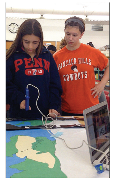
Figure 4. High school student helping middle school student collect data with the Pasco<sup>™</sup> PASPORT Light Sensor.