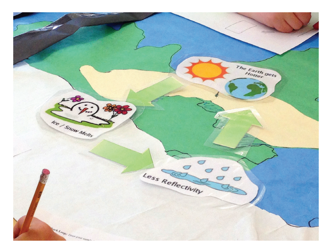
Figure 6. Students arrange cards to discover how a melting Arctic is part of a positive feedback loop that impact Earth's climate.