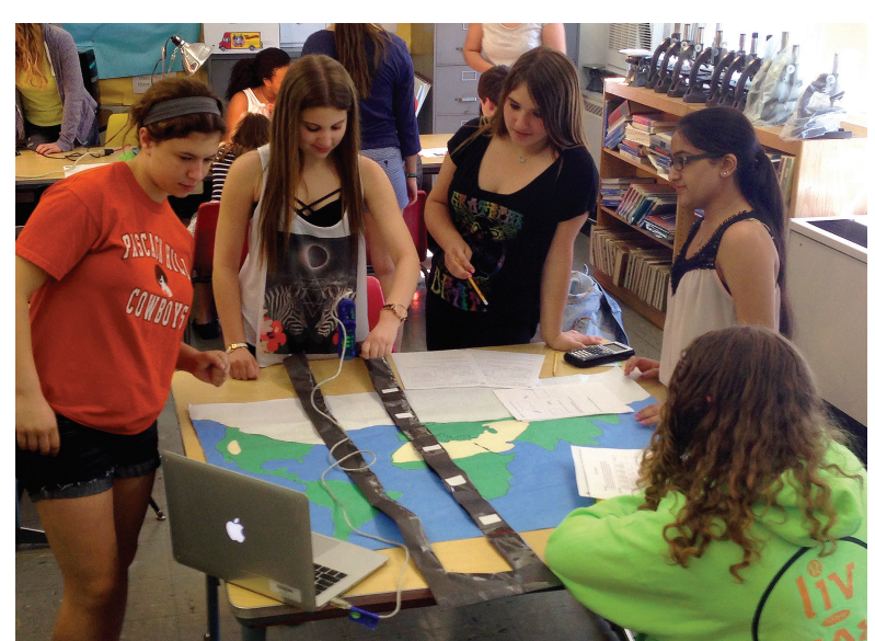
Figure 5. Climate Stewards Club members helping the middle school students collect data using the Pasco<sup>™</sup> PASPORT Light Sensor.

But often, students needed some prompting to identify the light source as a variable that affected the data retrieved from their model. The teams commenced collecting data once the class agreed on a procedure that accounted for all necessary controlled variables (Figures 4 and 5). Students used this datasheet (1.usa. gov/10VoKPv).