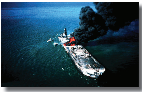
Seagrasses provide food and habitat for different species of fish, lobster, wading birds, manatees and sea turtles. In Tampa Bay, more than 70 percent of seagrass meadows have been destroyed by pollution, coastal development, dredging, and boat propellers.