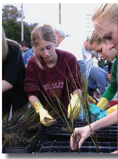
Students in the Tampa Bay area grow marsh grasses and seagrasses, and assist with monitoring and planting to restore damaged habitats.