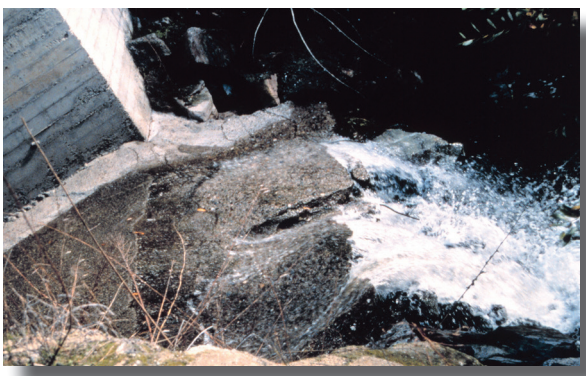
Adobe Creek in Sonoma County, California was once alive with salmon and steelhead trout; but after years of pollution and neglect, state officials declared it "dead."