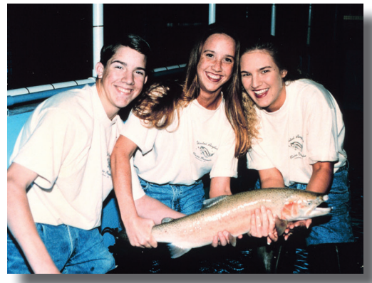
Students at Casa Grande High School built the only student run fish hatchery in the lower 48 states, removed trash from Adobe Creek, planted trees, so that Steelhead and Chinook salmon are once again spawning in the steam.