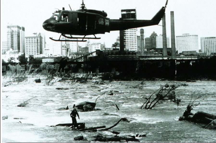
Virginia National Guard helicopter rescuing an individual from the James River. Note: rescued man halfway up to helicopter. Helicopter crewman standing on debris in river.

"Fifteen years ago, storms battered the West Coast of the United States...There were droughts in Australia, Indonesia, and India...Worldwide, 2,000 people died...Economic losses amounted to billions of dollars...In Indonesia and Borneo, dry conditions fed raging forest fires that consumed hundreds of thousands of acres. Smoke blanketed the area..."